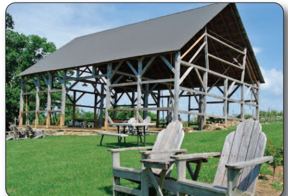
The Old Volstead Barn, rebuilt with exposed beams

Bootlegger's Red may have got its name because the barn on the vineyard was moved, beam-by-beam, from the farm once owned by Andrew Volstead who authored the National Prohibition Act of 1919. It's ironic that the Volstead Barn now sits proudly and artistically in a vineyard!