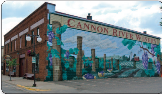
The Winery in Cannon Falls